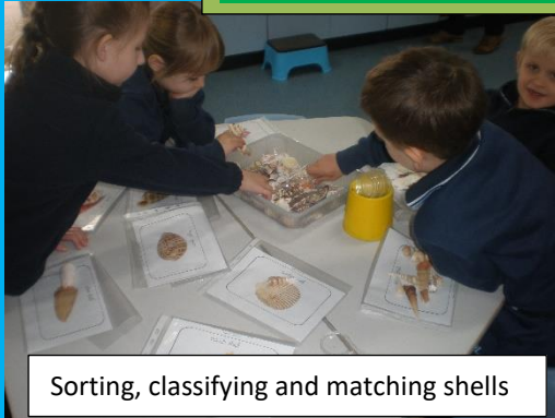
Sorting, classifying and matching shells