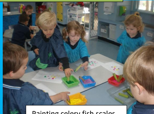
Painting celery fish scales.