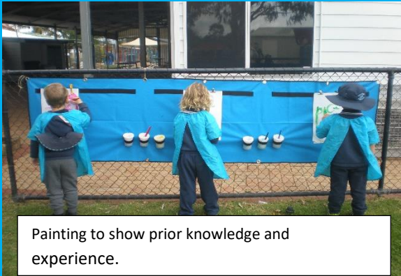
Painting to show prior knowledge and experience.

We completed a unit of work all about the ocean. We developed problem solving, investigation and enquiry skills through hands-on tasks and play.